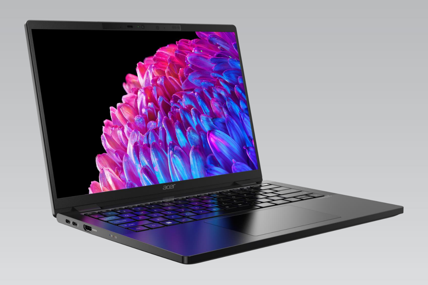
TravelMate P6 14