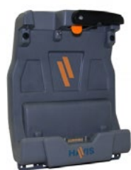
Havis Vehicle Docks