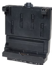
Gamber Johnson Vehicle Dock