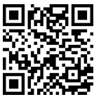
S410 3D demo