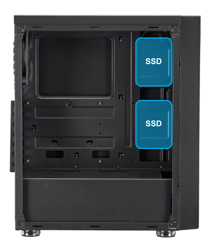
120mm Fan Inside For optimal cooling *CMT141 with Addressable RGB fan