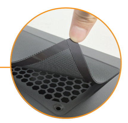
Detachable Mesh Top Cover For easy-clean and improving air filters on the top.

IO Panel on Top With USB3.0 x 1 and USB2.0 x 2 for smooth data transmitting.