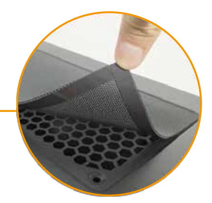
Detachable Mesh Top Cover For easy-clean and improving air filters on the top.

IO Panel on Top With USB3.0 x 1 and USB2.0 x 2 for smooth data transmitting.