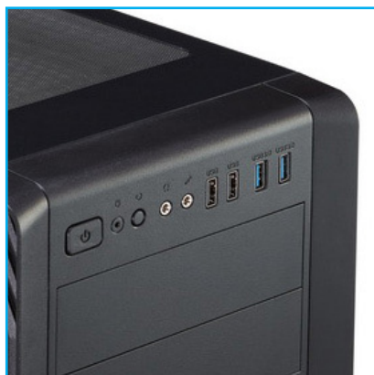
Built-in 2 x USB 3.0 and 2 x USB 2.0