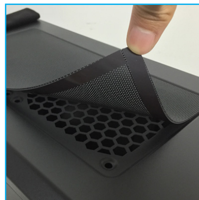
Detachable Mesh Top Cover