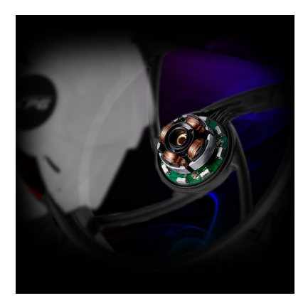
FLUID DYNAMIC BEARING (FDB)