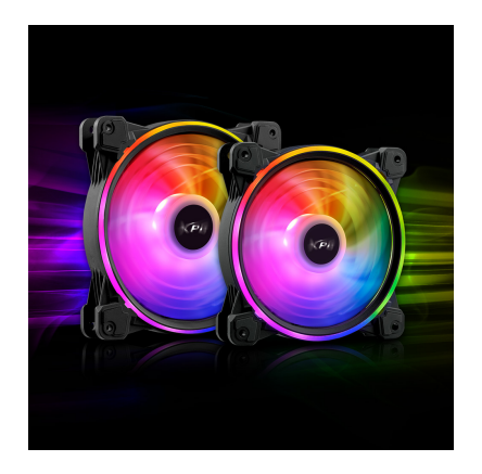
DUAL-RING ARGB LED DESIGN

The XPG HURRICANE ARGB PWM fan series is designed with mesmerizing dual-ring ARGB lighting effects and amazing cooling performance. Compatible with most major motherboard ARGB software, the XPG HURRICANE series is ideal for PC enthusiasts and modders. Available in both 120mm and 140mm models, this series is ideal for most users that demand both aesthetic value and top-tier cooling performance in one cooling solution.