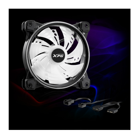
4-PIN PWM DESIGN