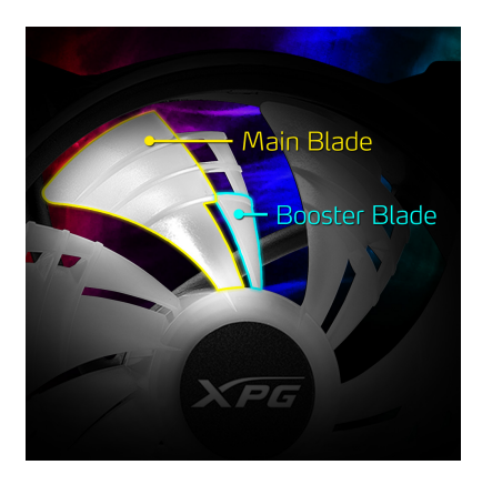
PATENTED FAN BLADE DESIGN