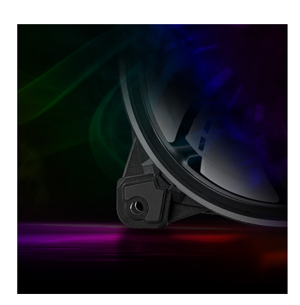
SILENT FAN OPERATION