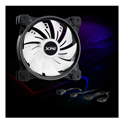
4-PIN PWM DESIGN