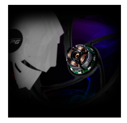
FLUID DYNAMIC BEARING (FDB)