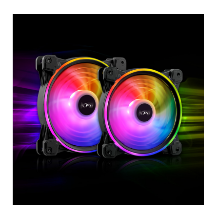
DUAL-RING ARGB LED DESIGN

The XPG HURRICANE ARGB PWM fan series is designed with mesmerizing dual-ring ARGB lighting effects and amazing cooling performance. Compatible with most major motherboard ARGB software, the XPG HURRICANE series is ideal for PC enthusiasts and modders. Available in both 120mm and 140mm models, this series is ideal for most users that demand both aesthetic value and top-tier cooling performance in one cooling solution.