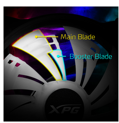
PATENTED FAN BLADE DESIGN