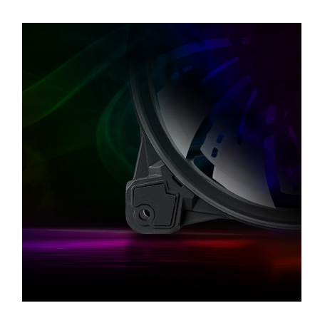
SILENT FAN OPERATION