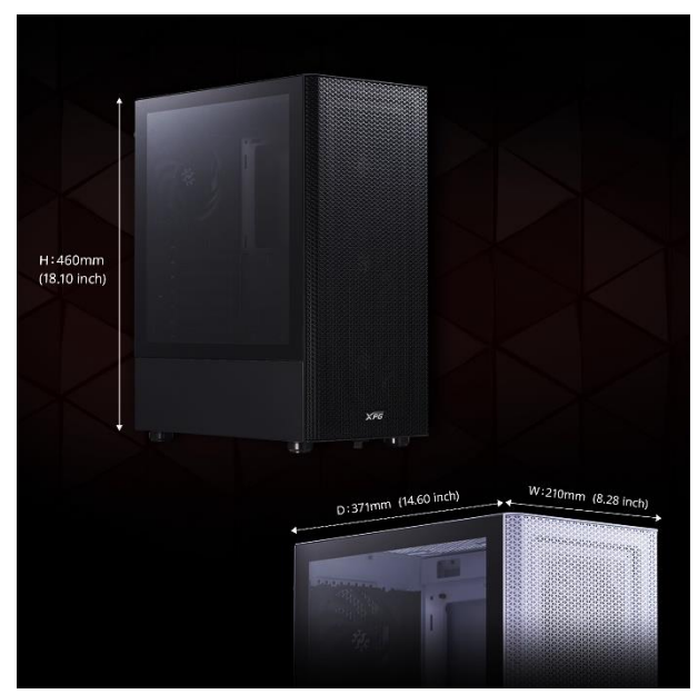
SMALL SIZE, INFINITE OPTIONS