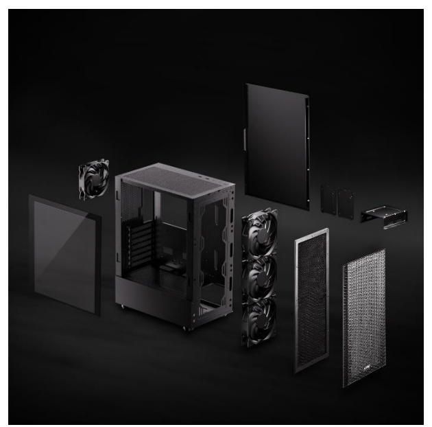
COMPACT DIMENSIONS with 4x 120mm PRE-INSTALLED FANS