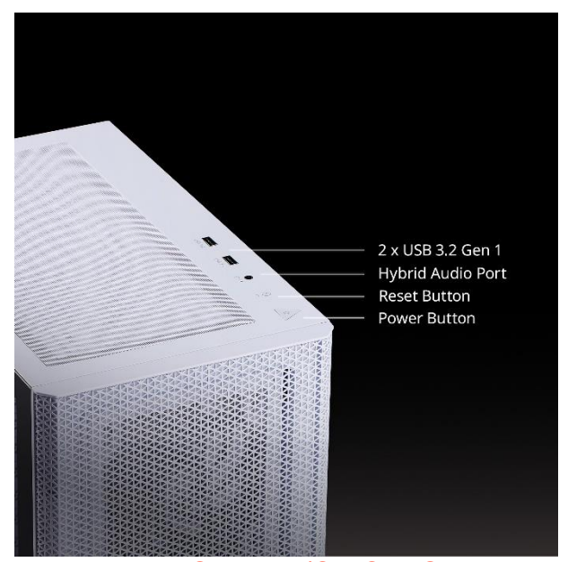
VERSATILE I/O PORTS