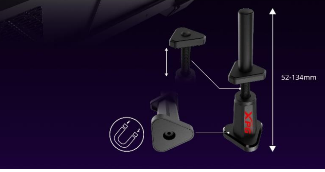
Strong, Adaptable Graphics Card Holder