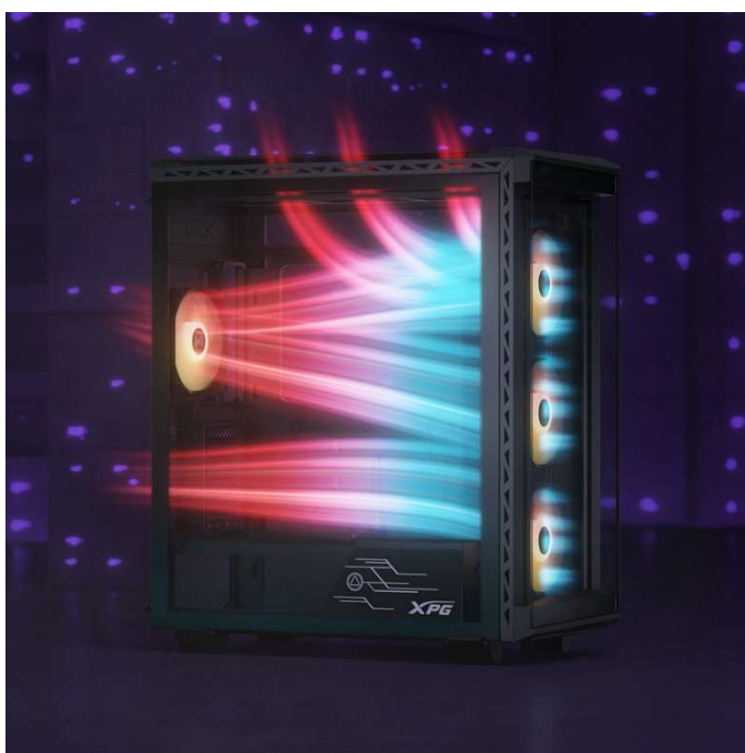
Optimized Airflow and Xtreme Cooling Efficiency