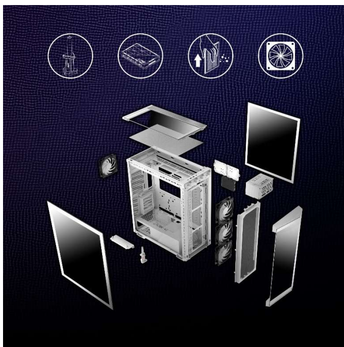
Easy Building, Easy Cleaning