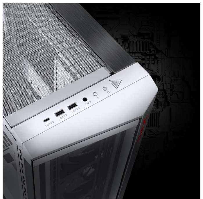
Efficient I/O Panel Design