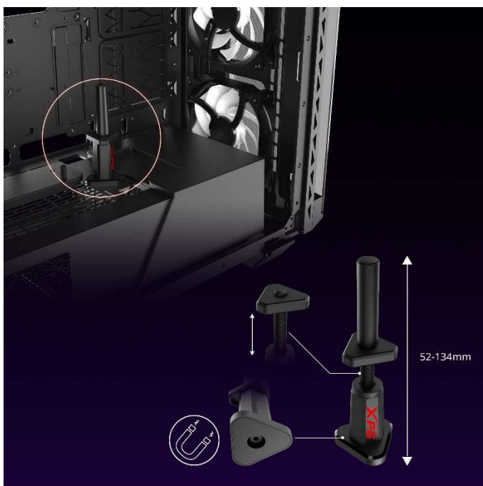
Strong, Adaptable Graphics Card Holder