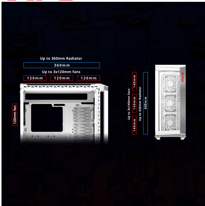
Enhanced Compatibility for Advanced Cooling Solutions