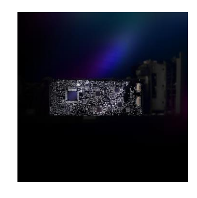
DIGITAL CONTROL SOLUTION