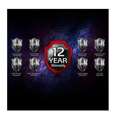
12-YEAR WARRANTY with 8 INDUSTRIAL PROTECTIONS