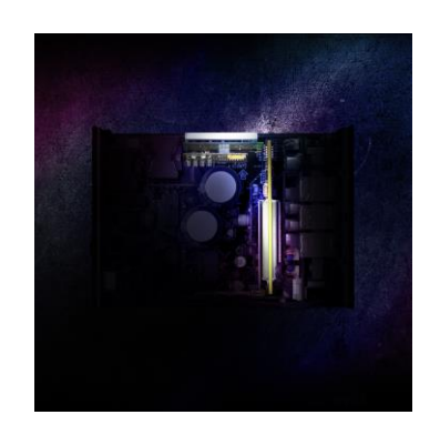
PATENTED PLANAR TRANSFORMER