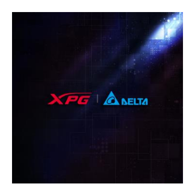
DESIGN COLLABORATION WITH DELTA ELECTRONICS

XPG FUSION 1600 TITANIUM is a premium grade Full-Digital power supply unit. It offers software based customization and data monitoring for a variety of user scenarios, ensuring the PC system can operate continuously and safely 24/7/365. To maximize efficiency and performance, XPG FUSION incorporates patented technologies from DELTA including a Planar Transformer and GaN FET solution. It also utilizes 100% Japanese capacitors at 105°C grade to ensure stability and consistency of power delivery. Certified Titanium by both 80 PLUS and Cybenetics, XPG FUSION 1600 TITANIUM is the ultimate consumer grade PSU.