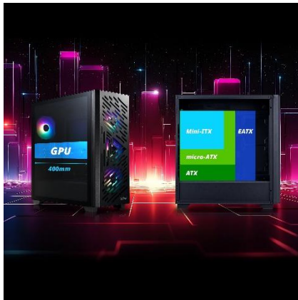
Supports Up To 400mm GPU And E-ATX