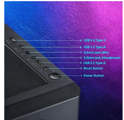
Versatile I/O Panel With Front USB-C