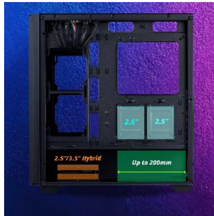
Up To 4 Drive Bays For Storage Expandability