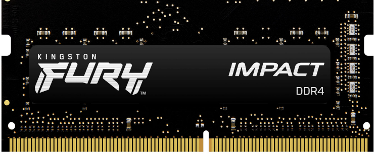
The product images shown are for illustration purposes only and may not be an exact representation of the product. Kingston reserves the right to change any information at anytime without notice.