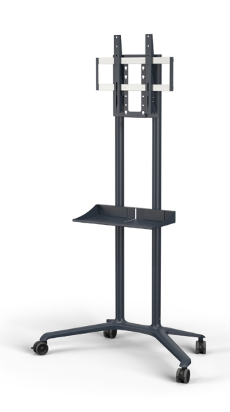
PD04-Tipster Trolley with optional accessory PD04-MS Multi-use Shelf

The ingenious two-pipe design adds further to the clean look of PD04-Tipster. The pipes have room for cables, which can exit just above the casted aluminum foot, or under it, whichever suits the installation best.