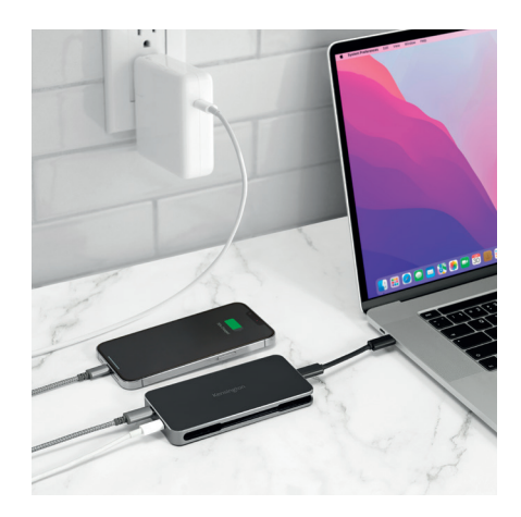
Up to 85W Power Pass-Through

*macOS only supports dual video in mirror mode (not extended) up to 4K \oplus 60Hz.