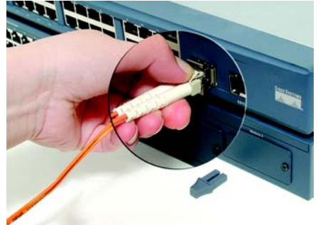
Figure 1-5: Removing the fiber cable