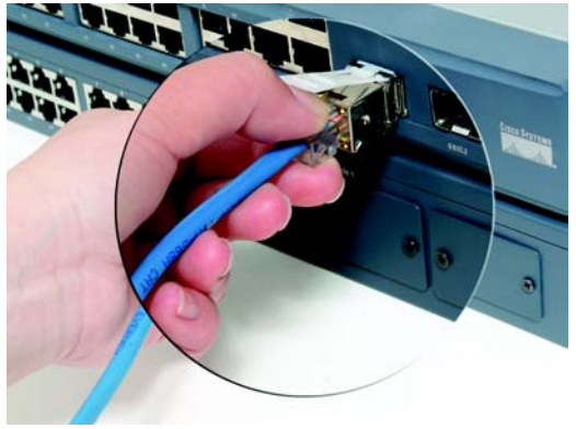
Figure 1-11: Remove the Cat5 cable