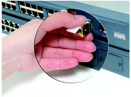
Figure 1-9: Lock the pull tab