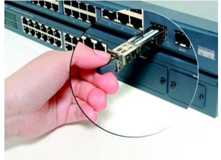
Figure 1-1: Insert the Module