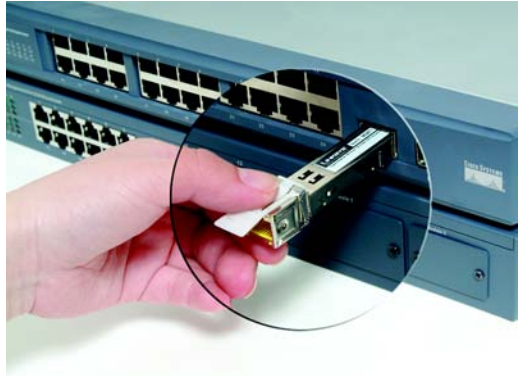
Figure 1-8: Insert the MGBT1