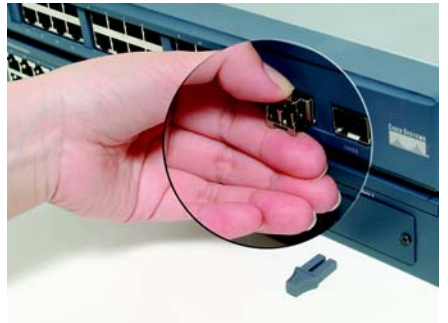
Figure 1-6: Pull the bail latch