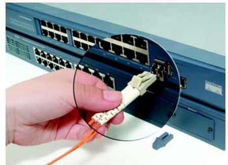
Figure 1-3: Connect the fiber cable