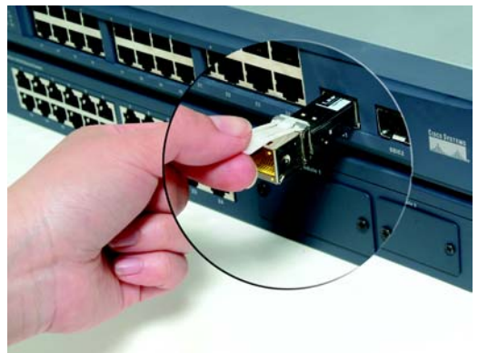
Figure 1-13: Remove the MGBT1