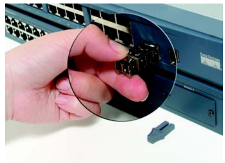
Figure 1-7: Remove the Module