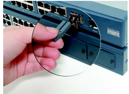
Figure 1-2: Removing the rubber port cap