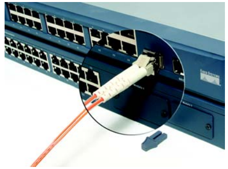
Figure 1-4: The connected fiber cable