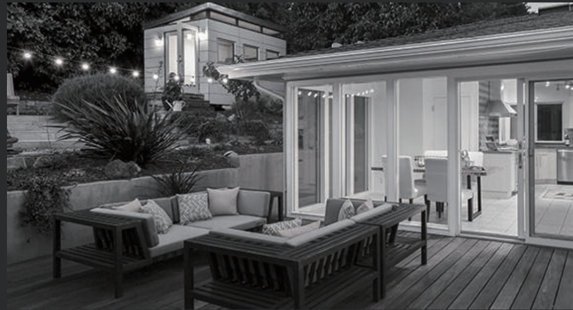
Night images from the C3WN

Experience it with the C3WN, seeing in the dark by using powerful Infrared LED lights.