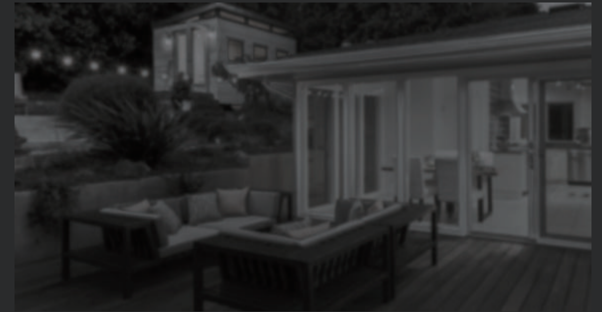
Night images from other cameras