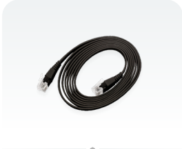
UTP Flat Cable (1.5m)