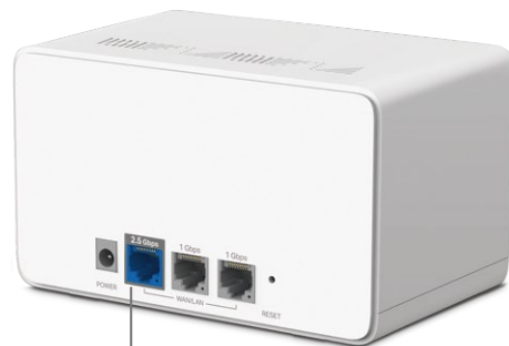
2.5 Gbps Port