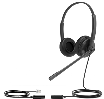
YHS34/YHS34 Lite Dual