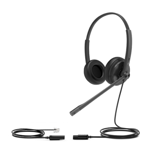
YHS34/YHS34 Lite Dual