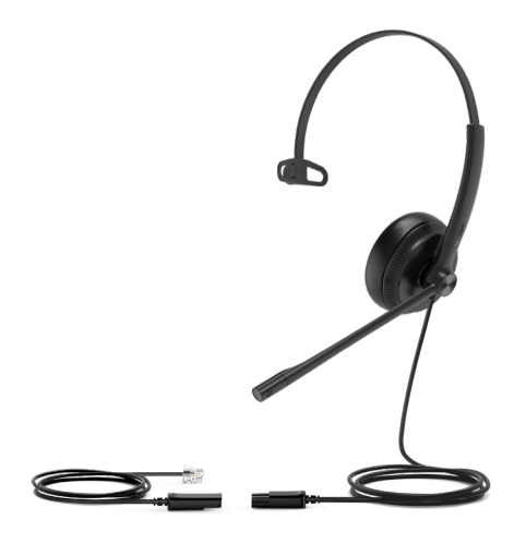
YHS34/YHS34 Lite Mono

Built for comfort with soft ear cushions and ultra-lightweight materials, the YHS34/YHS34 Lite is 10%~30%* lighter than other headsets in the same range. Its ergonomic design makes this headset comfortable enough for long conference calls and all day use. (* Test data provided by Yealink Lab)