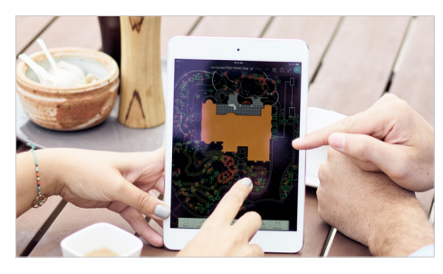
AutoCAD web app

Take the power of AutoCAD with you wherever you go-even offline. With easy-to-use tools, take measurements on-site and edit CAD drawings during client meetings, on any smart phone or tablet. Download the AutoCAD mobile app from your app store. Sign in with your Autodesk ID and get started.