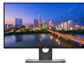
DELL ULTRASHARP 27 MONITOR | U2718Q

This space-saving stand, mounts up to two 27-inch monitors, providing the screen real estate you need to be most productive.