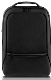
DELL PREMIER SLIM BACKPACK 15 | PE1520PS

This lightweight and compact powerbank will keep your laptop or cellphone powered on-the-go without adding bulk to your bag.