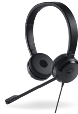
DELL PRO STEREO HEADSET | UC350

Connect your Latitude to almost any device with a convenient 6-in-1 compact adapter.