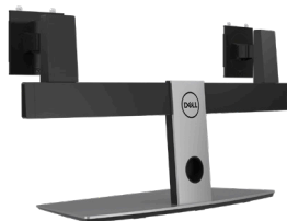
DELL DUAL MONITOR STAND | MDS19

Work at full speed with Dell's powerful Thunderbolt Dock. Charge your system faster, support up to three 4K displays and connect to your peripherals via a single cable.