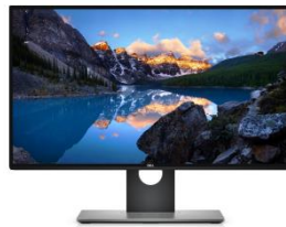
Dell Ultrasharp 25 Monitor - U2518D