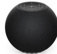
Dell Wireless 360 Speaker - AE715