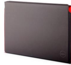
Dell Premier Sleeve (M)