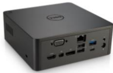
Thunderbolt™ Dock - TB16 (consumer)