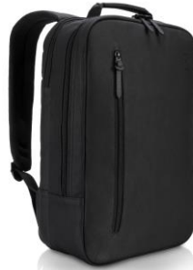
Dell Premier Slim Backpack 14