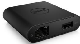
Dell Adapter - USB Type C to HDMI/VGA/Ethernet/USB 3.0