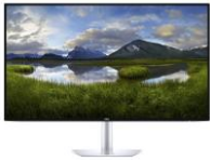
Dell 27 USB-C Ultrathin Monitor - S2719DC