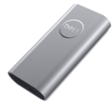
Dell Portable Thunderbolt™ 3 SSD, 500GB (SD1-T0500)(M)