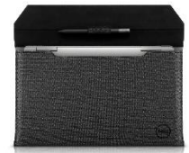
Dell Premier Sleeve - XPS 15