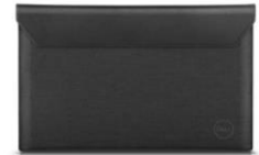
Dell Premier Sleeve - XPS 17