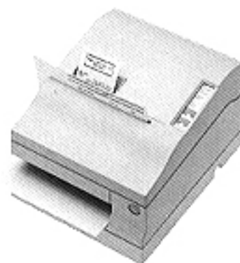
1.5 Station Printer TM-U925

Using the EPSON OCX Driver for the TM-U950 will allow you to reduce time and money spent on developing POS application software.