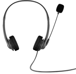
HP Stereo USB Headset G2