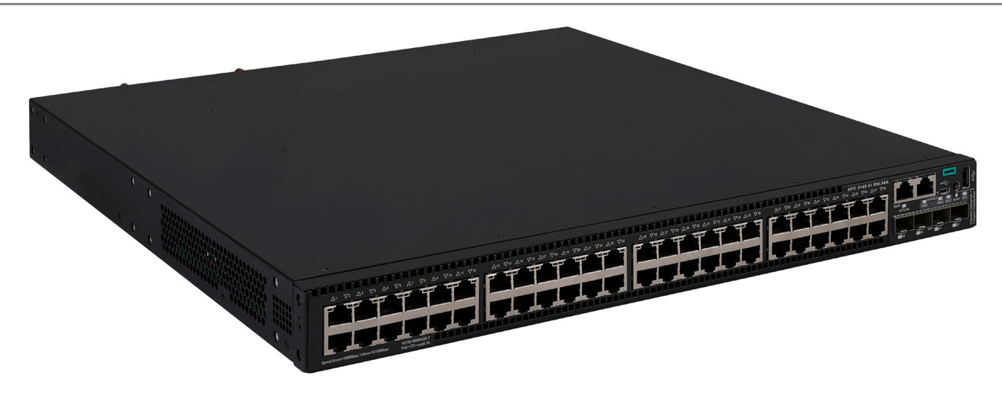
HPE FlexNetwork 5140 HI Switch Series

This switch series also includes Smart MC at no additional cost and combined with Intelligent Management Center (IMC), provides both embedded network management, enhanced network visibility and automation