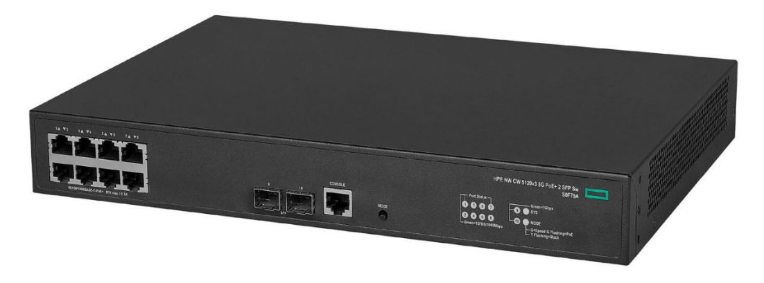
HPE Networking Comware 5120 v3 Campus Switch Series

This switch series also includes SmartMC at no additional cost, and when combined with HPE Intelligent Management Center (IMC), it provides both embedded network management and enhanced network visibility.