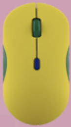
Lenovo 350 Bluetooth Silent Mouse (Fan Edition - Brazil) GY51U71760