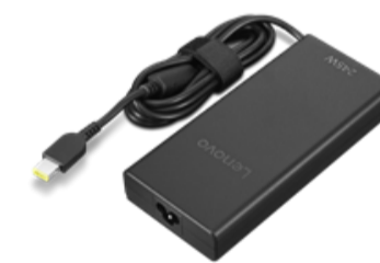
Lenovo 245W AC Adapter (Slim tip)-EU