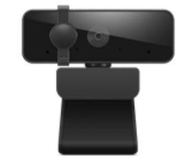
Lenovo 310 FHD Webcam Black