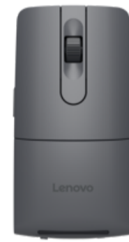
ThinkPad Bluetooth Presenter Mouse (Aura Edition)