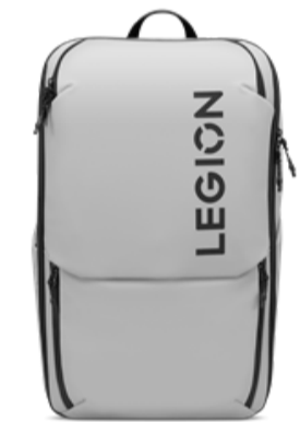
Lenovo Legion 17" Gaming Backpack GB800 (Light Gray)