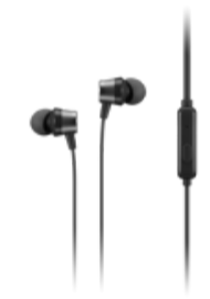
Lenovo Analog In-Ear Headphones Gen II Bulk Package (20pcs)