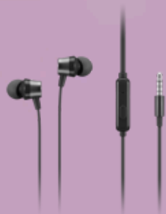
Lenovo Analog In-Ear Headphones Gen II Bulk Package (20pcs) 4XD1T54899

Please click here to view the full list of accessories.