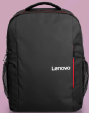
Lenovo 15.6 Laptop Everyday Backpack B510-ROW 4X41U80414