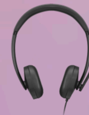
Lenovo Wired VoIP Headset 5000 4XD1R88995

Please click here to view the full list of accessories.