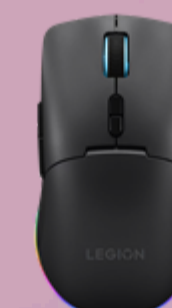
Lenovo Legion M220 Wireless RGB Gaming Mouse GY51U28359