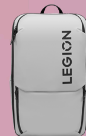
Lenovo Legion 17" Gaming Backpack GB800 (Light Gray) GX41U39300