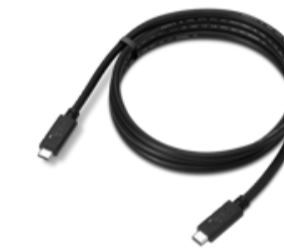
Lenovo USB 20Gbps USB-C to USB-C Cable 1.5m