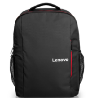
Lenovo 16" Laptop Everyday Backpack B510