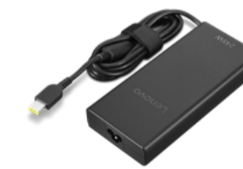
Lenovo 245W AC Adapter (Slim tip)-EU