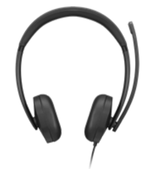
Lenovo Wired VoIP Headset 5000 (Teams)