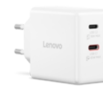
Lenovo Dual USB-C 65W GaN Charger