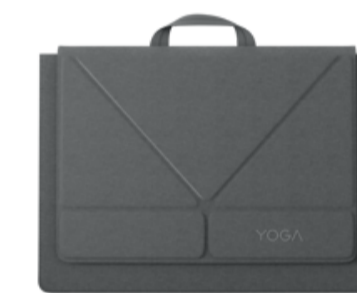
Lenovo Yoga Tote Sleeve (14" Grey)