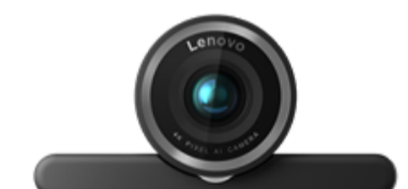
Lenovo 4K Pro Webcam