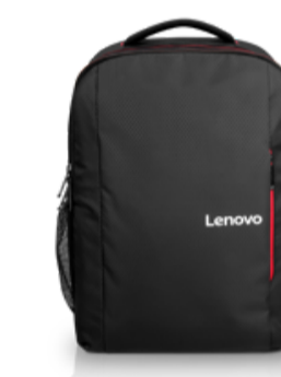
Lenovo 16" Laptop Everyday Backpack B510