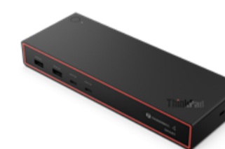
ThinkPad Thunderbolt 4 Smart Dock Gen2 7500 - US