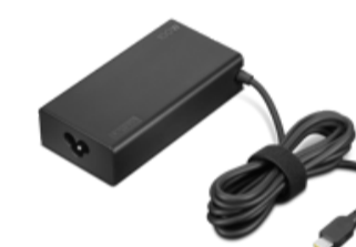
Lenovo USB-C 100W AC Adapter-EU