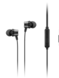
Lenovo Analog In-Ear Headphones Gen II Bulk Package (20pcs)