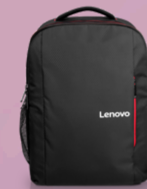
Lenovo 16" Laptop Everyday Backpack B510 4X41U80414

Please click here to view the full list of accessories.