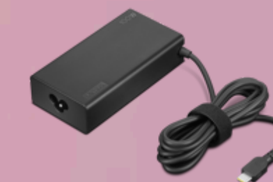
Lenovo USB-C 100W AC Adapter-EU GX21V43585