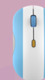
Lenovo 350 Bluetooth Silent Mouse (Fan Edition - Argentina) GY51U71763

Please click here to view the full list of accessories.