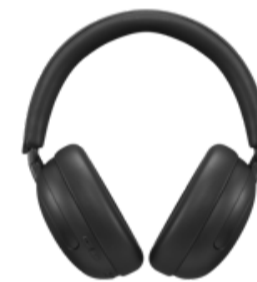
Lenovo Wireless Headphone 2000