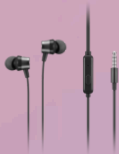
Lenovo Analog In-Ear Headphones Gen II Bulk Package (20pcs) 4XD1T54899