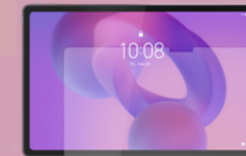
Lenovo Idea Tab Plus Glass Screen Protector ZG38C07403