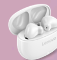
Lenovo E310 True Wireless Stereo Earbuds standalone-white GXD1Q65145